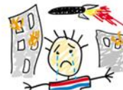
Child Bereavement/ Traumatic Events