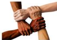
General Support and Guidance

Click the images below for links to the relevant support information available.